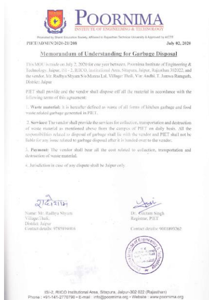
MOU for garbage disposal